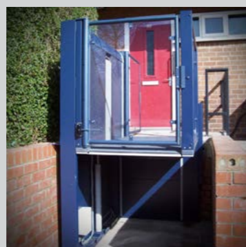
Plexi - Glass Gates