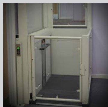
Special Colour Finishes