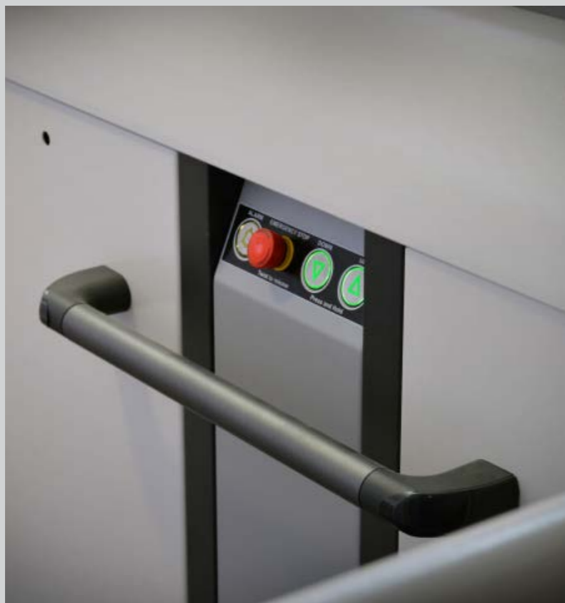
High Spec Controls